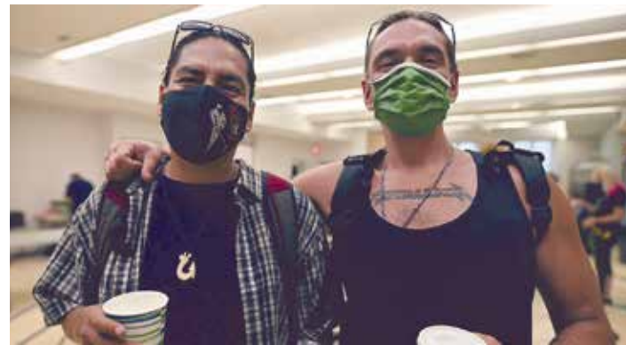
▲ Community members gather for fellowship at St. Luke’s Table, a downtown Ottawa drop-in centre for the homeless and those at risk of homelessness, and a recipient of AFC funding.

In response to Say Yes! to Kids , the foundation received 84 applications for post-pandemic youth programs with a total request of about $518,000. Donations